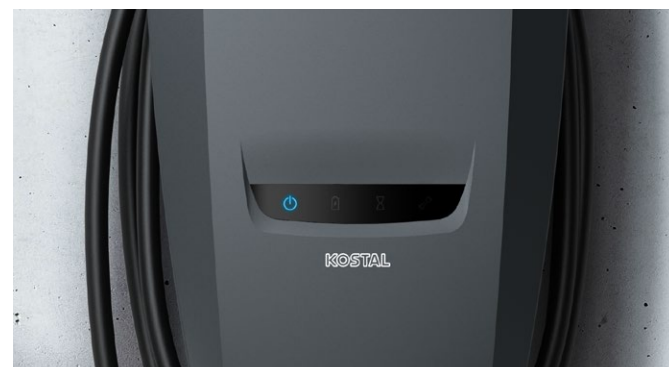
Everything always visible at a glance: LED display