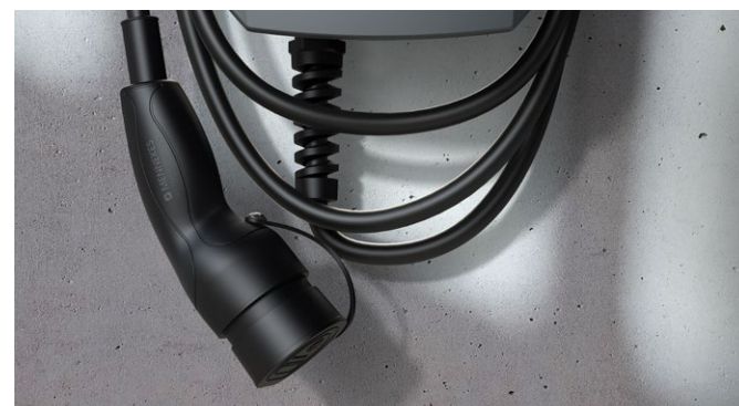
Always to hand: 7.5 m type 2 charging cable